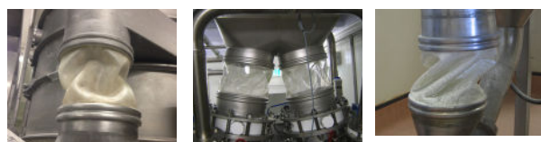
Installation gap too small

If the installation gap is too big, the connector will be stretched and difficult to install and remove from the spigot. The seal may also not be 100% dust tight anymore and service life will be compromised. If it is too small, the connector may have excessive creases, creating more product contact.