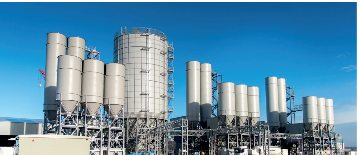
View of Bylor's three concrete batching plants, including a GGBS Silo at Hinkley Point C (December 2017).

When plans to build Hinkley Point C nuclear power station were first put on the drawing board, we were contacted at an early stage by industry-leading concrete batching plant manufacturers D and C Engineers and asked to assist in helping to design mixing and batching equipment that could cope with the demands and challenges of a project of this size.