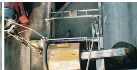
ComTec system in the ready-mix concrete plant