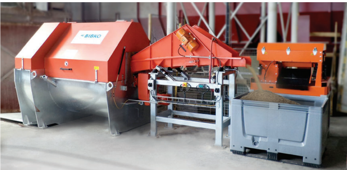
ComTec 4 in the precast plant