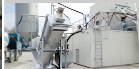
RWS compact system

Recycling systems for precast and read-mix concrete plants – Cost-efficient. Durable. Modular.