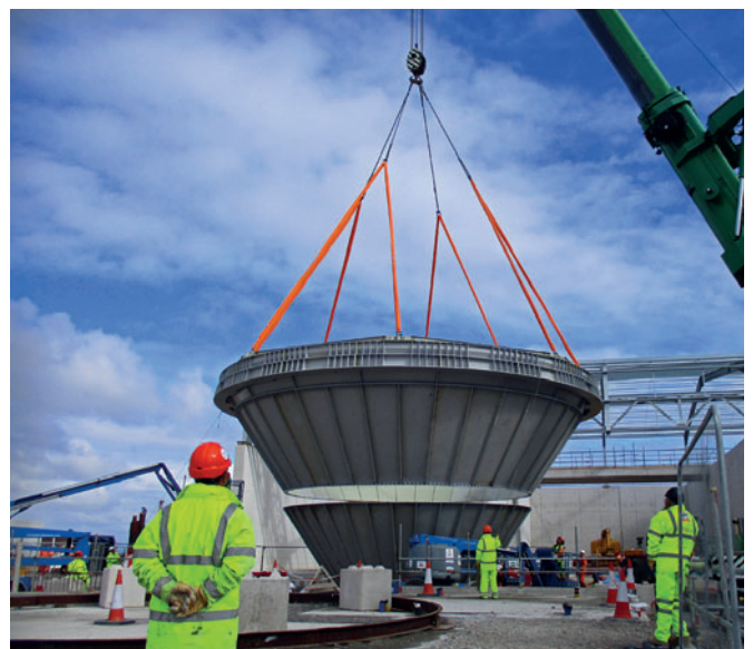
Construction of the base cone for the ground granulated blast furnace slag (GGBS) silo (April 2017).

This essential equipment plays a key role in keeping the mix quality at nuclear standard.