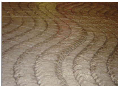
Table plates play an important role in the successful operation of a block machine. They are subject to many forms of wear including abrasion, erosion and impact, all of which are exacerbated by pressure. Premature failure often leads to pallet damage, whilst replacement is difficult, disruptive and causes safety issues. On the basis that prevention is better than cure, ExtraChrome~Snake table plates offer a safe, cost effective and efficient alternative to improve block plant operation.