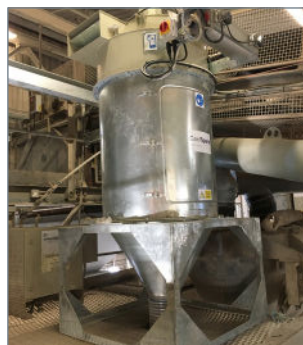
CDX 25 - Double cartridge For larger mixer capacities