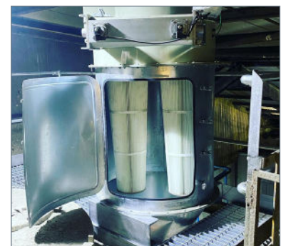
Quick and safe cartridge access Reverse jet cleaning extends life

Visit - www.conspare.com | Call +44 (0)1773 860796 | Email - sales@conspare.com