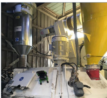
CDX 12.5 - Single cartridge Compact footprint for tight spaces

CDX filters are installed throughout the UK on pan, planetary and twinshaft mixers ranging in capacities from 500 litres to 4500 litres. The system utilises innovative conical cartridges which enable the filter to offer superior performance combined with lower operating costs, simpler maintenance and better reliability.