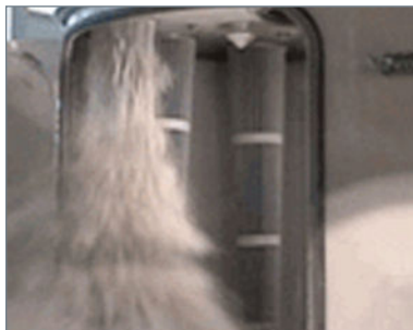
High efficiency cleaning

CSV 21 and 24.5 filters are smaller in diameter than other models which is made possible due to the use of conical cartridge technology. It is not recommended to install parallel cartridges as spacing will become restricted leading to a loss of efficiency through increased cross contamination and re-entrainment. Certification may also be compromised.