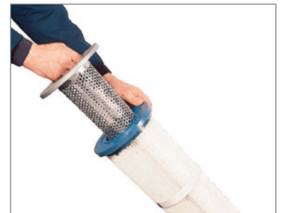
Reusable inner mesh core

Visit - www.conspare.com | Call +44 (0)1773 860796 | Email - sales@conspare.com