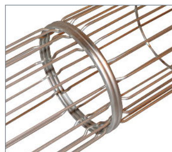
Hook and claw or patented double ring connections