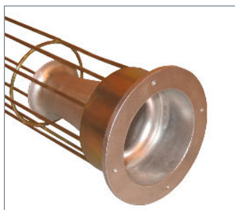
Dirty side or clean side removal. With or without venturi