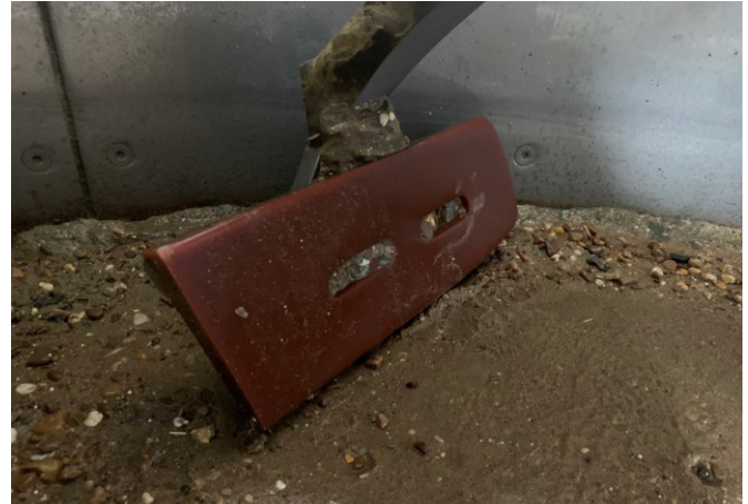
Hawiflex® - triple the wear life and still in operation