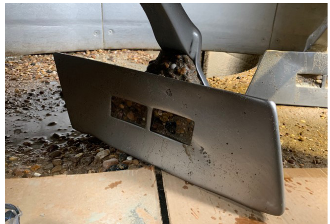
OEM cast steel blades required constant attention

As the gaps between mixer blade and pan floor grew, a layer of residual concrete gradually started to build across the mixing pan. To keep the mixer in good working order, the plant operator had to increase the amount of time spent cleaning the mixer each day.