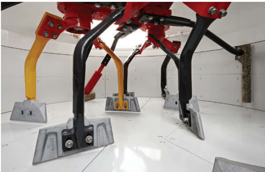
The TEKA units have provided the next-generation mixing technology Besblock were looking for

The block-making firm brought in ConSpare because of their close relationship with the TEKA brand, but it was their creative thinking