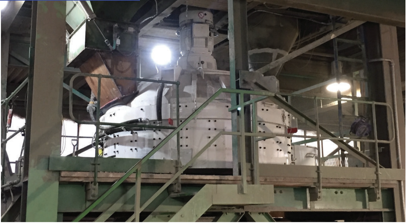
One of Besblock's new TEKA planetary mixers, supplied and installed by ConSpare