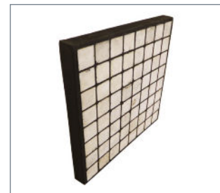
Ceramic insert option

Visit - www.conspare.com | Call +44 (0)1773 860796 | Email - sales@conspare.com