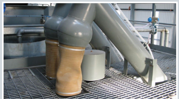
Durable flexible connectors

Comprehensive range of replacement components