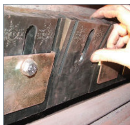
Quick and simple to maintain