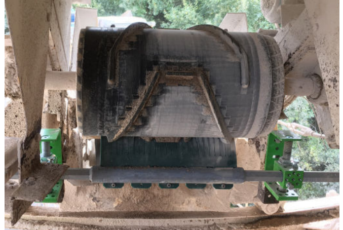
Starclean Chevron cleaner in situ

The chevron cleaners have proven a simple and low maintenance solution. All 10 are the same model, and this standardisation has simplified both training and maintenance across the region.