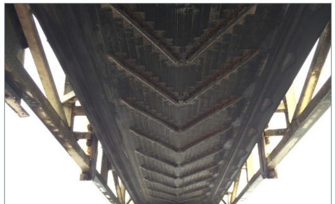
Starclean providing a good level of cleaning