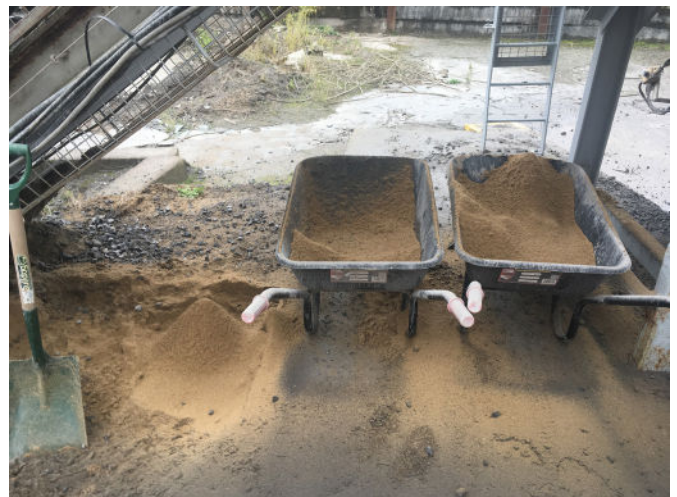
Carryback underneath one of the chevron belts

The air knives were particularly troublesome. In addition to not dealing with the carryback, they also created dust and used around 4kw of electricity each. As a result, many of these devices were not being maintained or had been turned off.