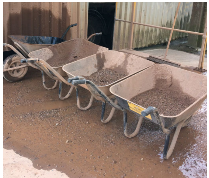
Removing 8+ wheelbarrows per day under single belt