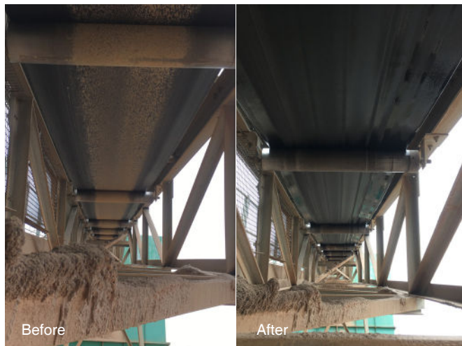
Starclean results on clients' other belts - back to black