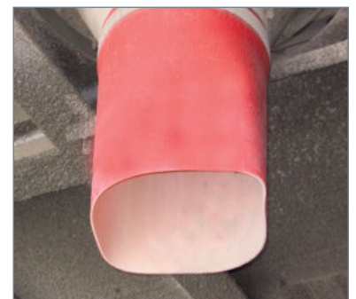
Maximum tear resistance

Visit - www.conspare.com | Call +44 (0)1773 860796 | Email - sales@conspare.com