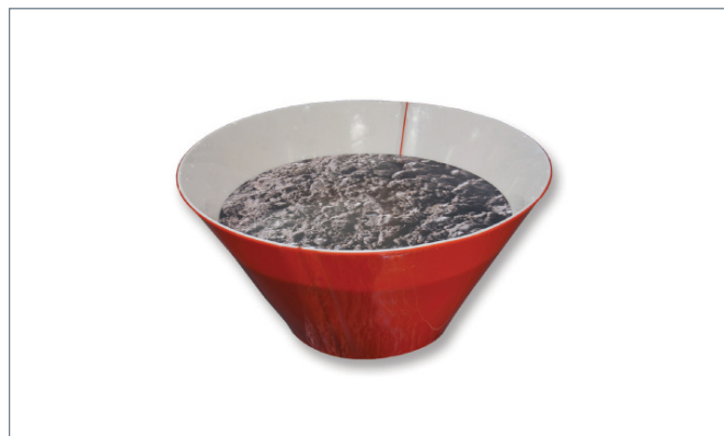
ConeFlex chute liner solution with dual layer wear indicator