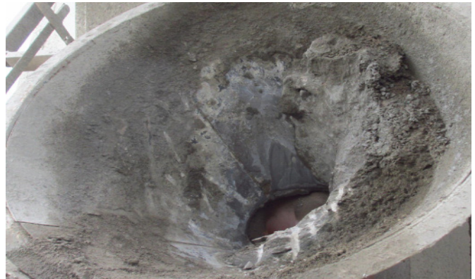
Typical example of build up in steel discharge chute

If blocked, the mixer discharge chute becomes a bottleneck, jeopardising production and impacting on mixer operation.